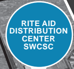
RITE AID DISTRIBUTION CENTER SWCSC