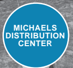
MICHAELS DISTRIBUTION CENTER